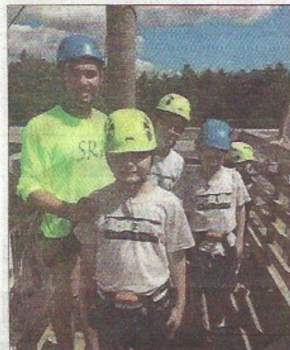
CORSE students got to travel and stay close by for various adventures this summer.