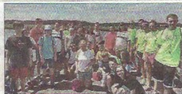
All Stars Summer Extreme drew a big crowd.