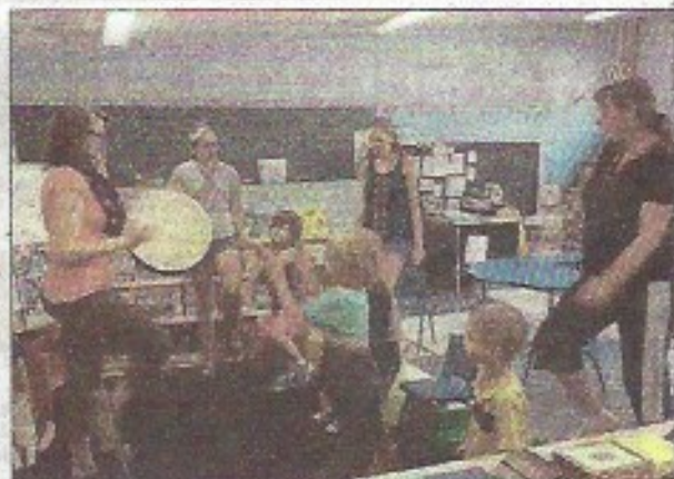
Circle of Friends is a classroom based activity that gets kids thinking and moving.