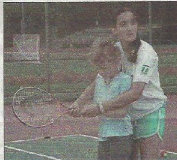
CORSE volunteers help teach the participating students new skills, such as how to play tennis.