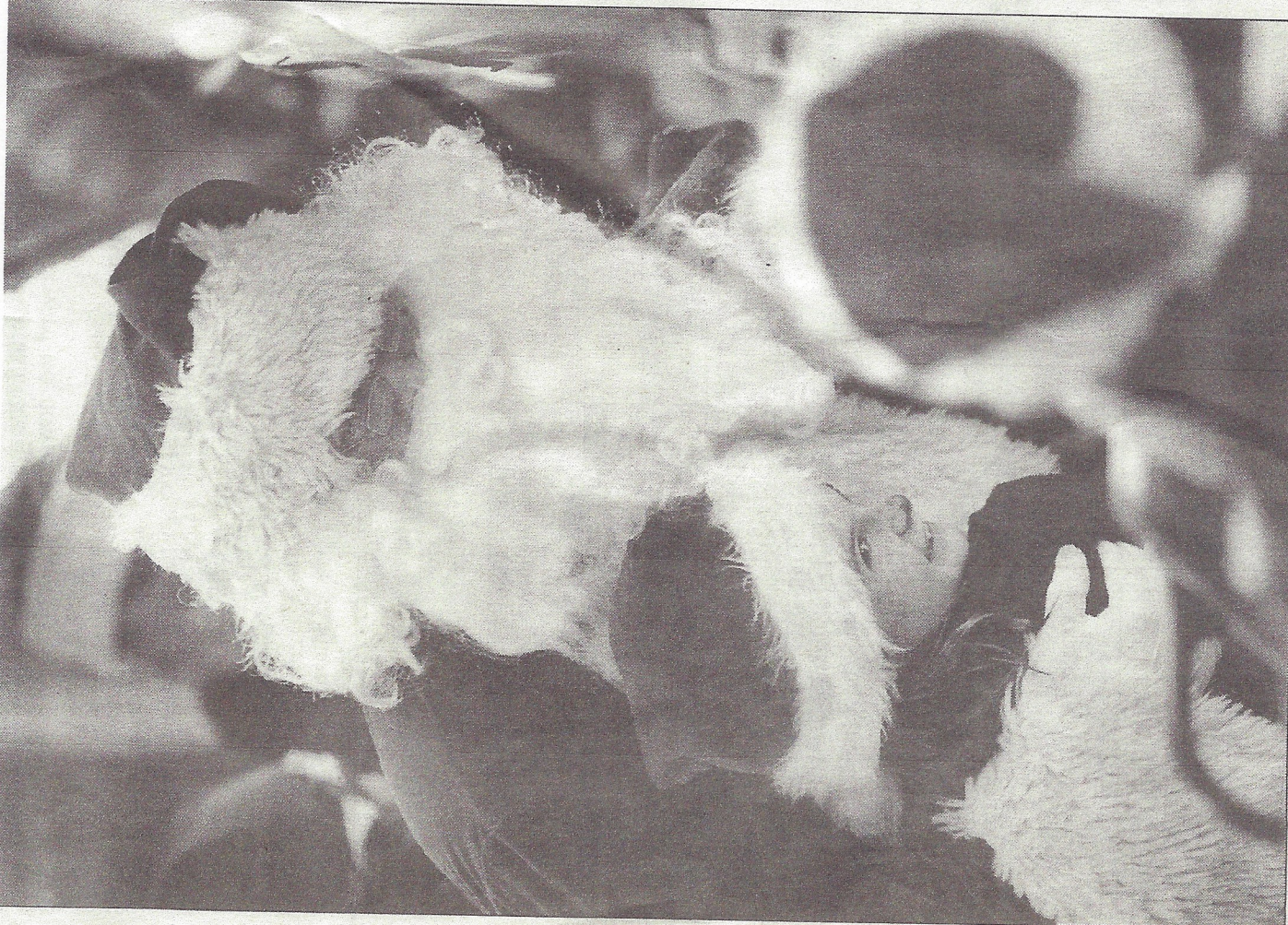
Santa makes a surprise visit to meet the children on the seventh annual Scituate North Pole Express.